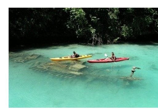
Put your deposit in today to secure your spot on this trip of a lifetime!

lunch at one of the white sand beaches and let our guides tell you all about the diversity of flora, fauna and birds of the Rock Islands.